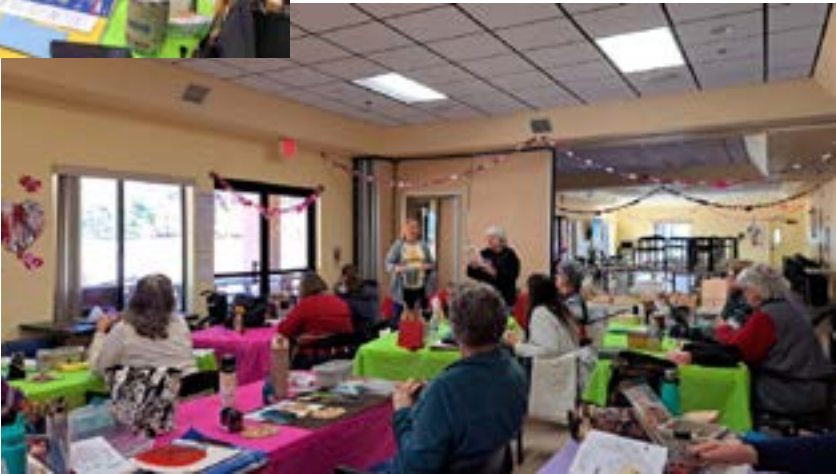
PAINT-IN RAFFLE AND A HAPPY WINNER