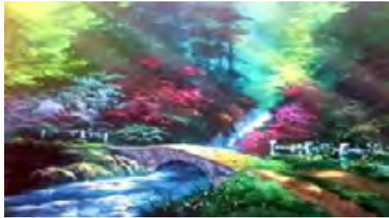
Pathway to Eden- Sat. Nov 11,2023 11x14 inch canvas

November 11 and 12, 2023 (9 am- 4 pm PST)