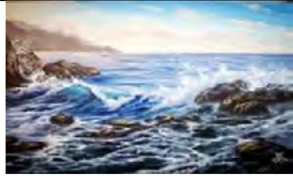
Tidal Forte- Sunday Nov 12, 2023 11x14 inch canvas