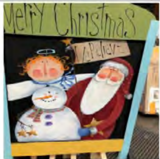
Sept 2, 2023

Where: Donna's Shop Art's Creations 1085 Broadway El Cajon, CA 92021 619-440-3320