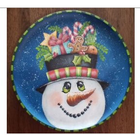
FEBRUARY 17 Project: Holiday Hat (ZOOM)

Surface Fee: Wood plaque or your choice of surface. 11" x 14"