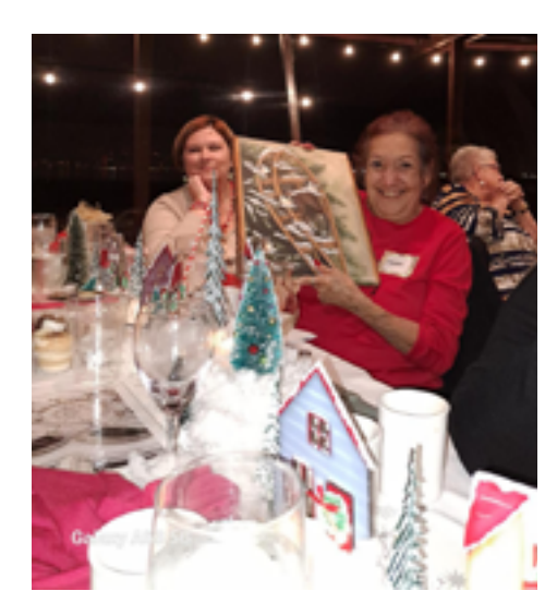
JUST A FEW OF OUR HAPPY RAFFLE WINNERS!